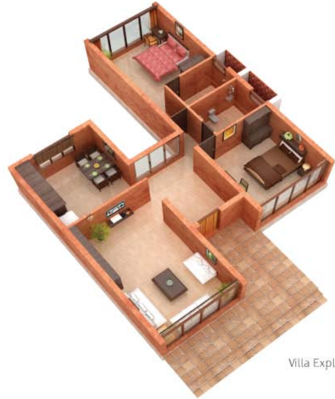
Villa Exploded View