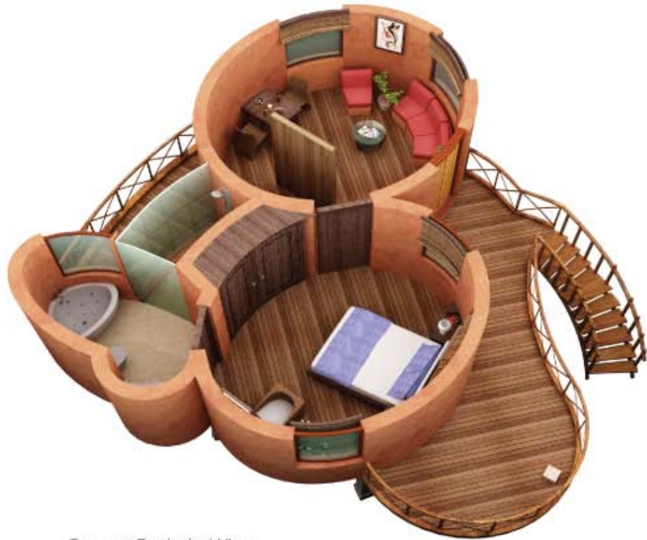
Cottage Exploded View