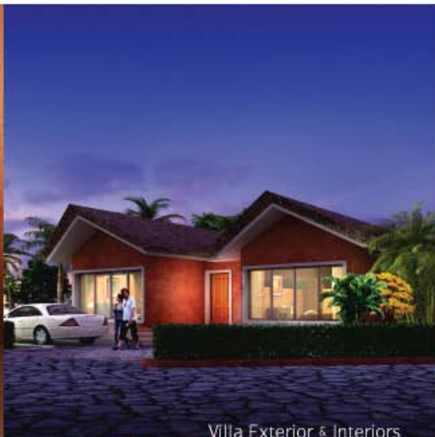
Villa Exterior & Interiors